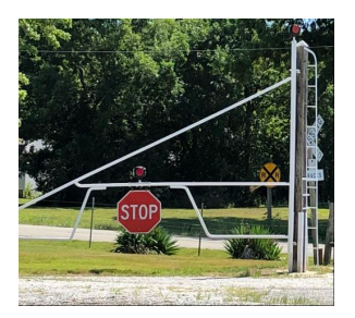
Answer next month

This is an item that is currently located at the Carona museum. What is it?