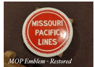
MOP Emblem - Restored

Carona. For decades, it was a fixture on the freight station and division office building for the MoPac. Later, for 10 years, it served as