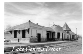
Lake Geneva Depot