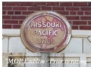
MOP Emblem - Prior to razing

The Missouri Pacific terra-cotta emblem that was located above the doorway to the freight station in Coffeyville has found its way to