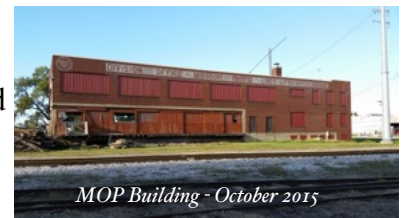
MOP Building - October 2015

the headquarters for Watco. When the building was torn down in October of 2015, the emblem was salvaged and placed into storage. There were four layers of brick that were still attached to the emblem and it was in dire need of some love and attention. Through the hard work of Kevin Anselmi, the emblem has been restored and now awaits display in the Webb Center at Carona. The plan is to construct a stand for it to be displayed in, similar to the Union Pacific emblem we currently have.