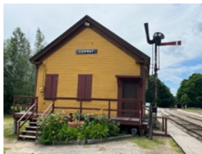
Conway Station - Turn around point

All of the trips travel through some very picturesque scenery, especially in the fall when the leaves are changing. The railroad currently operates 9 locomotives for their various trips. These include a 0-6-0 steam locomotive, #7470 built by the Grand Trunk Railway in 1921. The railroad also has an operation RDC-1 unit built in 1952 by the Budd Company that is used for special events. Rounding out the active roster are an EMD-GP35, two EMD-GP38's, an EMD-GP7, a GP9 and two F7A's. Steam locomotive #501, a 2-8-0 built by Aldo in 1910 is currently under restoration. The passenger cars include early 20th century coaches, mid 20th century coaches, dome cars and other special cars.