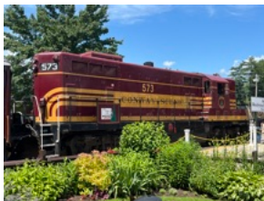
#573 - Lead our train excursion