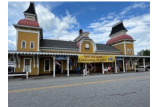
North Conway Station

In last month's issue, I talked about the recent Amtrak trip my wife and I took to Boston via Kansas City and Chicago. After arriving at Boston, we rented a car and travel to the northwest part of Vermont through New Hampshire and on to Portland, Maine before returning to Boston to catch our train back home. Along the way, we stopped in North Conway, New Hampshire to catch a ride on The Conway Scenic Railway.