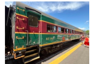
#6739 - Our coach car

All of the trips travel through some very picturesque scenery, especially in the fall when the leaves are changing. The railroad currently operates 9 locomotives for their various trips. These include a 0-6-0 steam locomotive, #7470 built by the Grand Trunk Railway in 1921. The railroad also has an operation RDC-1 unit built in 1952 by the Budd Company that is used for special events. Rounding out the active roster are an EMD-GP35, two EMD-GP38's, an EMD-GP7, a GP9 and two F7A's. Steam locomotive #501, a 2-8-0 built by Aldo in 1910 is currently under restoration. The passenger cars include early 20th century coaches, mid 20th century coaches, dome cars and other special cars.