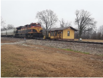
CPKC Bartlett shuttle train passing Carona depot